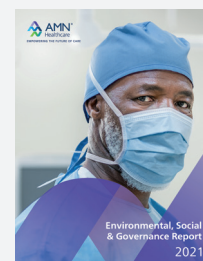
Environmental, Social & Governance Report